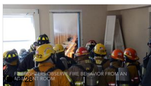
VIDEO: Live-fire firefighter training Mar 23, 2015

GOOD HART — Many in the Northern Michigan fire service community are mourning the loss earlier this week of a well-known area fire chief who has helped train hundreds of firefighters over the years.